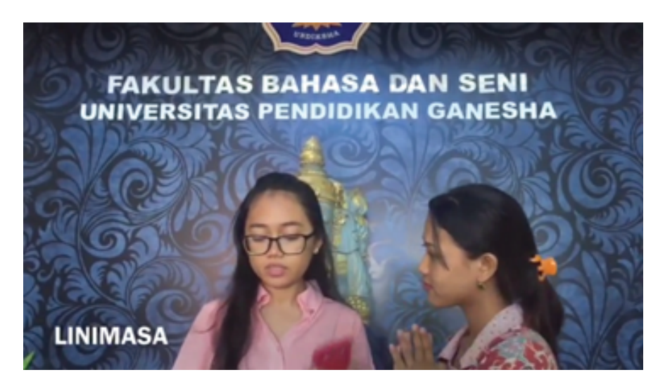
Figure 2: Scene of learning video about word equivalent on Youtube.