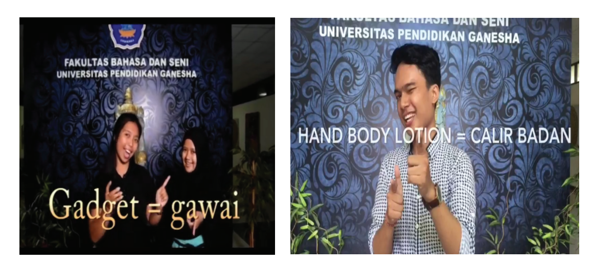
Figure 3: Scene of learning video about word equivalent on Youtube.

can also be shared in several social media, so it doesn't only give benefit for our self but also for all society.