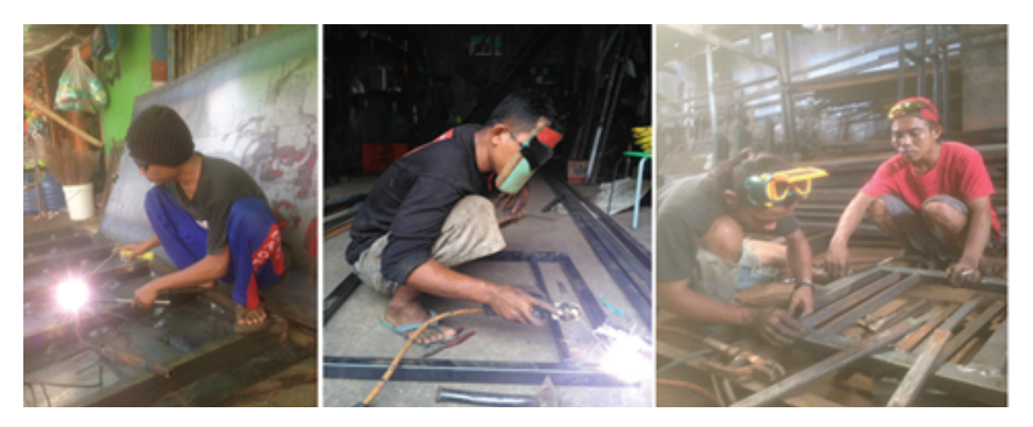
Figure 2: Welder posture.

(73%) worked less than 8 hours a day, but it was different with Ramadhana & Amir [3] which 74.6 percent of SMEs welders worked in range 7–12 hours/day.