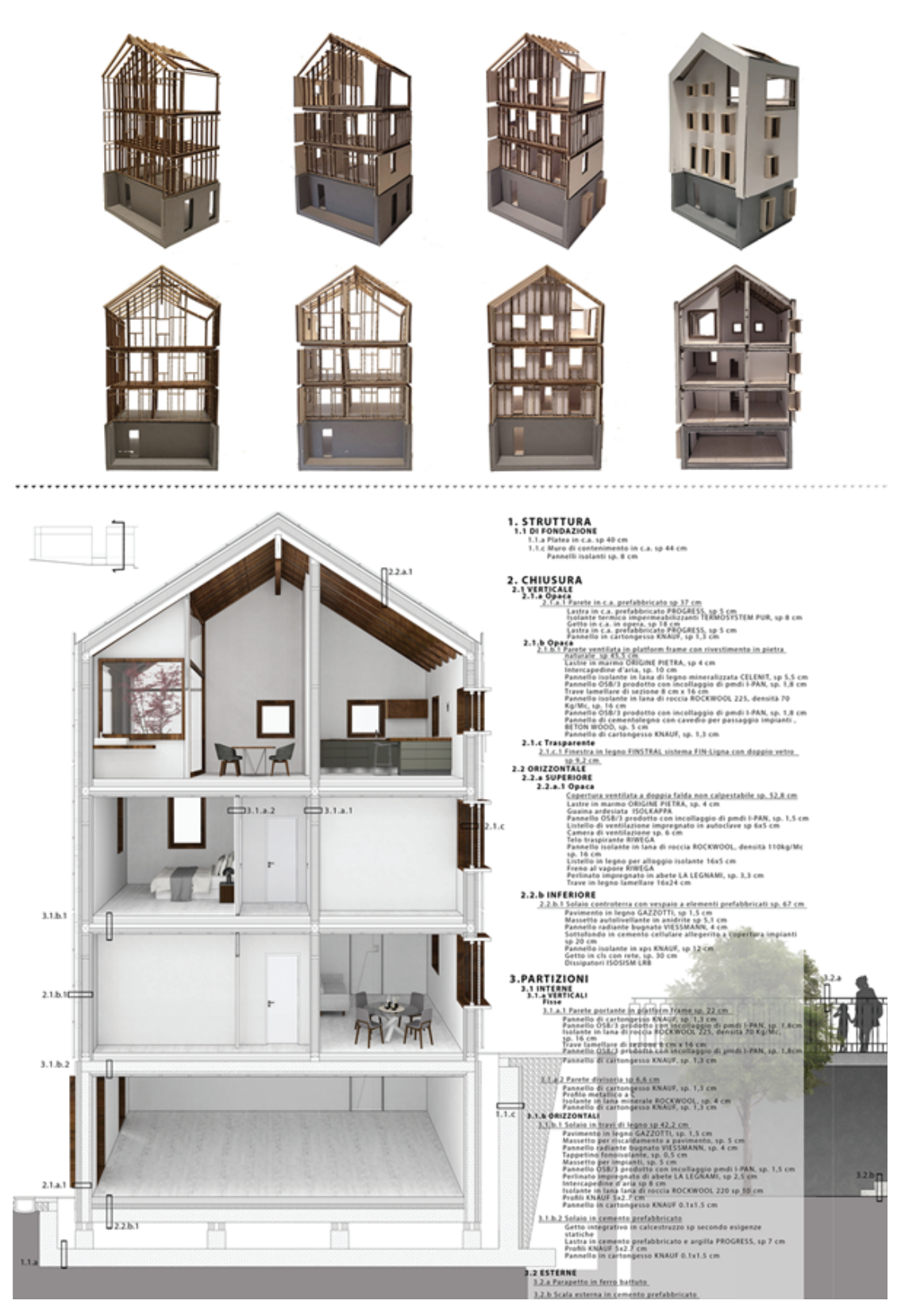
Figure 3: Strategies technological-constructive and detail section of new buildings.