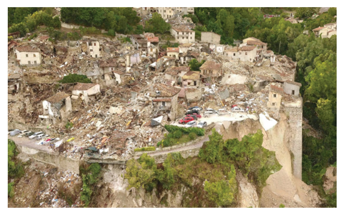
Figure 1: Pescara del Tronto after 2016 earthquake.

materials and systems is reported to bring other significant advantages over traditional construction, including superior quality control through prefabrication, better energy performance and reduced site deliveries, noise and pollution - and thus less disruption to existing communities. The sophistication and range of manufactured systems and components available today – and the opportunities that digital techniques and processes offer - mean that factory-made construction has enormous potential to make a positive contribution to reconstruction housing needs. However, the same level of consideration needs to be given to design, placemaking, amenity, infrastructure and public realm, as it would for any project built using traditional construction methods, to ensure that quality remains at the core of delivering new factory-made homes that will support and sustain local communities for the long term.