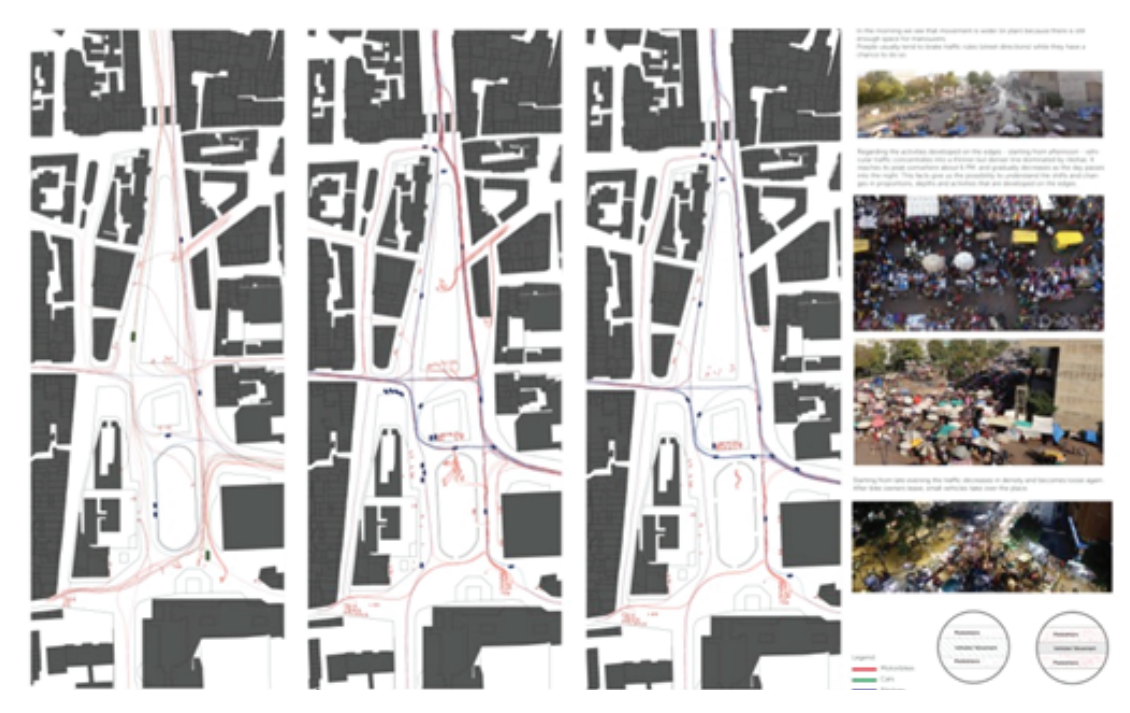
Figure 1: Ahmedabad: transition contexts; @CEPT University, Winter School 2015.

Public space is a definition that no longer convinces and it does not work anymore – for several reasons – neither in the European (Italian) context, nor for the Indian one. Because public space takes a fluid condition in Ahmedabad and it is no longer recognizable in the canonical figures that the Western Europe has always used to describe it.