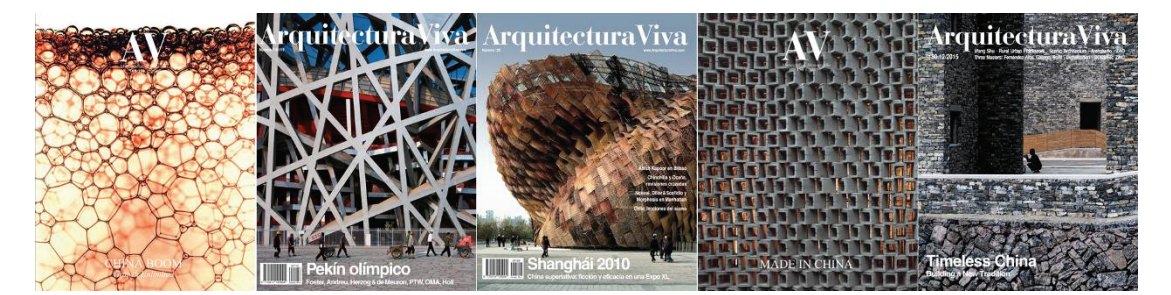
Figure 1: Covers of the five China issue.