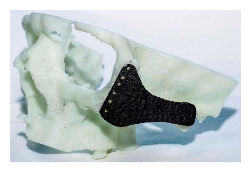
Fig. 3. Lithographic model of patient's K. facial skull before surgery and the frame of the implant