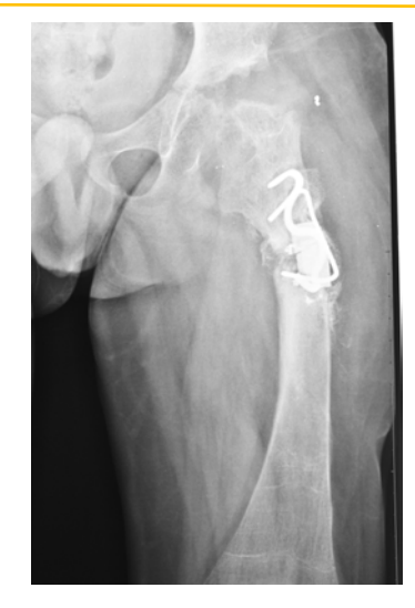
Fig. 4. The X-ray of the same patient 24 months after the surgical treatment