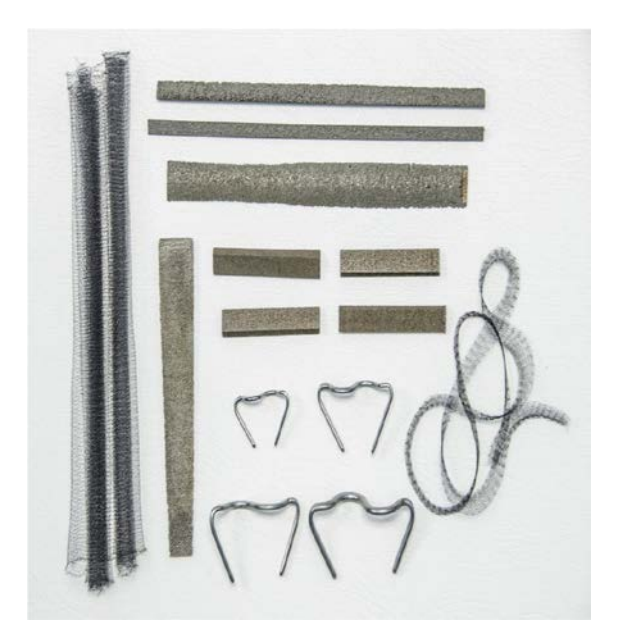
Fig. 1. The materials and structures of nickelid titanium used in the surgey of the false joints of long tubular bones

possibility of connective and muscular tissues ingrowth into the osteal wound on the part of the soft tissues in patients with insufficient bone periosteum, the bone wound surface from all sides is covered with thin-profile mesh implant based on 50-60 microns thick nickelid titanium with the cell size 1-3 mm (Fig. 1). The soft tissues are laid into the place, the wound is sutured and drained. If required, the limb is immobilized by a plaster cast.