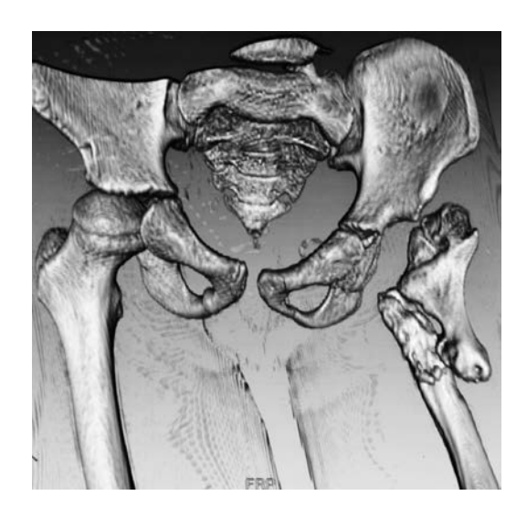
Fig.2. The X-ray of an 11 year-old patient with a dislocated head and the false joint of the left femur due to hematogenous osteomyelitis before the surgical treatment

implant material through the soft tissues was not observed. In figure 2-4 the clinical example is presented on pseudarthrosis of the left femur elimination in an 11 year-old patient which occurred due to hematogenous osteomyelitis.