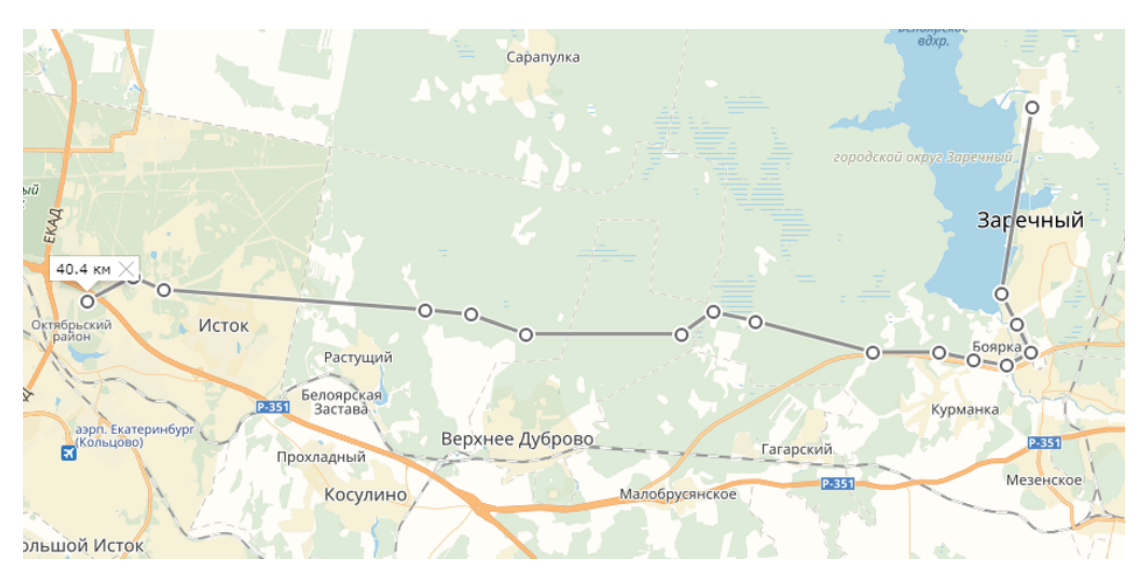
Figure 3: Possible version of the pipeline designed to avoid railways and settlements.

Estimated calculation of the pipeline was completed in order to verify economic efficiency of the heat supply of Ekaterinburg from unit with reactor BN-1200. New micro district of Ekaterinburg that will be built in the east side was chosen as a consumer of heat. The number of citizens is taken about 100 000 people for calculation. Pre-school and additional educational institutions, general educational institutions, health objects, trade objects, food objects, and objects of culture are planned to build. Possible version of the pipeline designed to avoid railways and settlements is shown in Figure 3. Total length is 41 km. The new apartment houses and objects of social purpose are expected to be supplied by heat through the heating network from Beloyarsk NPP. Total heating power of the apartment houses and social objects is 150 Gcal/h.