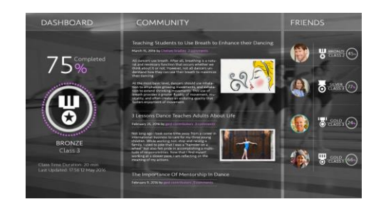
Figure 5: Community of Relevé.

Thirdly, another feature of this system is providing users with a unique virtual community. Since immersing into a self-learning system, we also provide an excellent way to let learners interact with other learners through the Relevé community. The design lets learners share their self-learning experience and process with other learners which provides an opportunity to build an interactive way to help and share each other's performance. Also, the community involves professional dancers, who will provide dancing technique and experience.