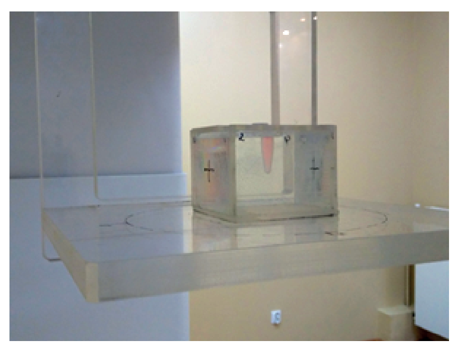
Figure 1: Water phantom with a test object on the table of the positioning system.