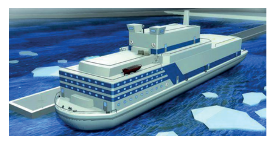
Figure 2: Appearance FPU.

board the FPU it is provided the accommodation of storages of spent reactor cores and means ensuring the implementation of recharges reactors.